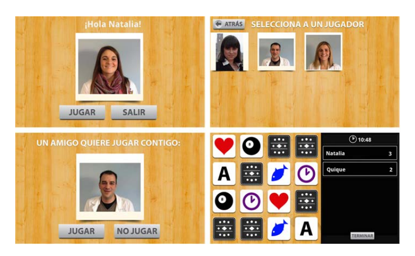
Figure 1. User interface

Figure 1 shows four different screens that are part of the application and follow the usability restrictions identified. Each of the screens implements one of the main functionalities of the platform: identification (top-left), opponent selection (top-right), invitation reception (bottom-left) and game (bottom-right).