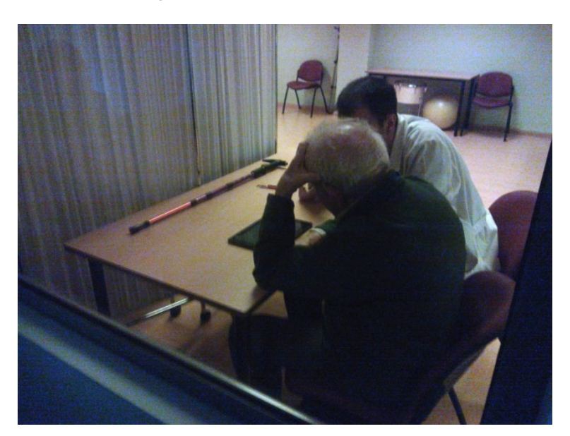
Figure 2. Evaluation procedure

Taking into account the game performance shown by users in the individual mode, the practitioners proposed certain users to play some games in the multiplayer mode. Their opponent could be another patient (who was in the same room) or another practitioner (who was in a different room).