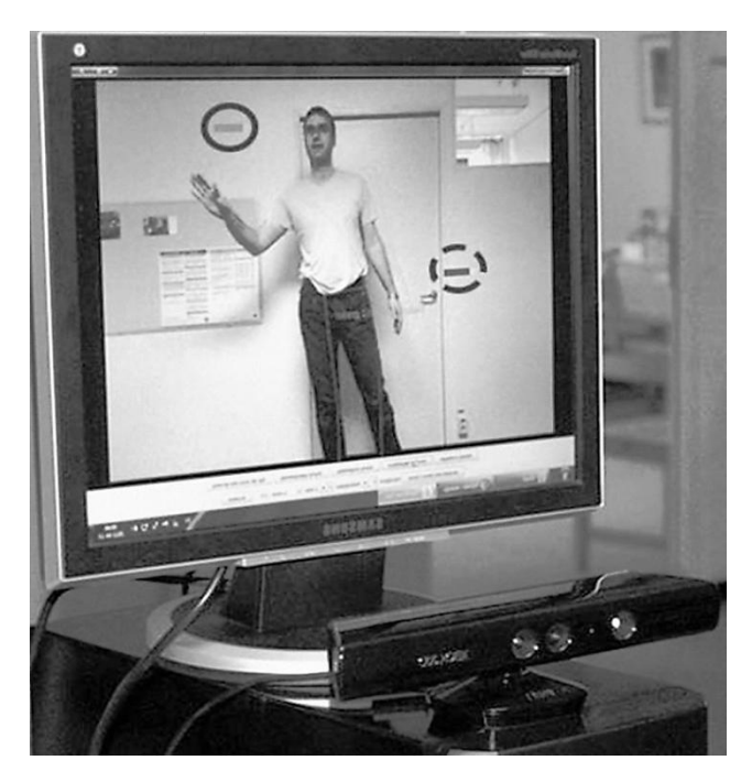
Figure 1. A screenshot from the player's perspective, in the upper right corner reaching for a red box (black circle) and at the bottom left corner a blue box (dotted circle) flies in.

A Kinematic Game for Stroke Upper Arm Motor Rehabilitation •• 86