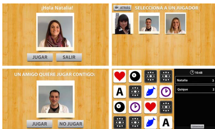
Figure 1. User interface

Figure 1 shows four different screens that are part of the application and follow the usability restrictions identified. Each of the screens implements one of the main functionalities of the platform: identification (top-left), opponent selection (top-right), invitation reception (bottom-left) and game (bottom-right).