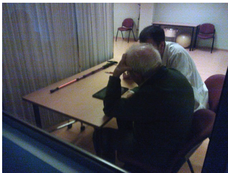
Figure 2. Evaluation procedure

Taking into account the game performance shown by users in the individual mode, the practitioners proposed certain users to play some games in the multiplayer mode. Their opponent could be another patient (who was in the same room) or another practitioner (who was in a different room).